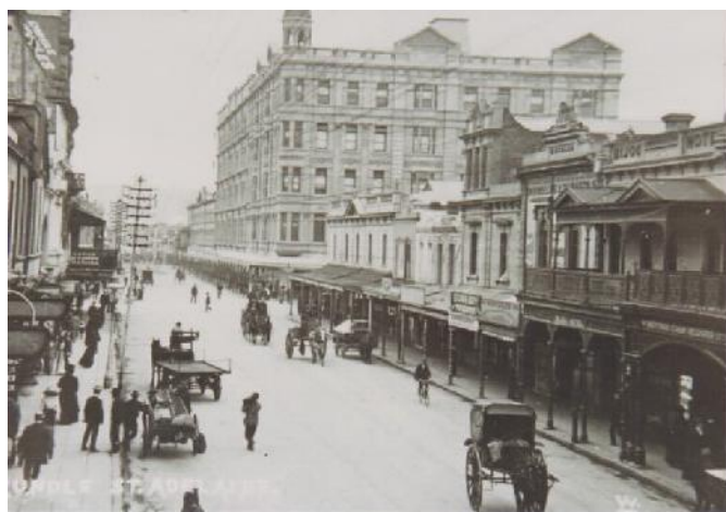
Rundle St looking east (1912) Grand Central Hotel on right.