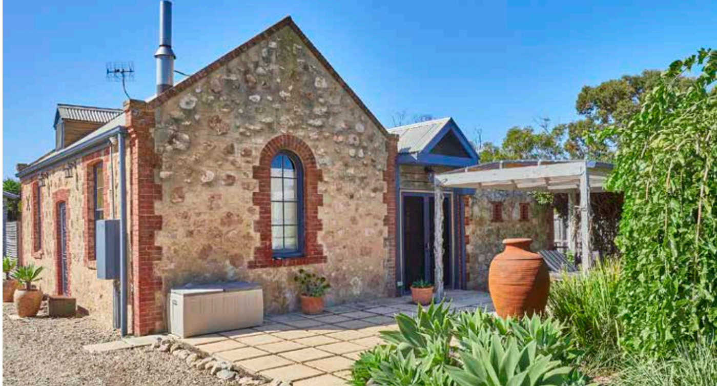
Private residence, Middleton