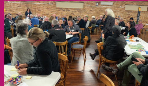
Clayton Bay Facilitated Event

All community members are encouraged to 'Stay Informed' on the relevant Village My Say page. Links to all Digital Conversation pages and more information is available at alexandrina.sa.gov.au/villageconversations