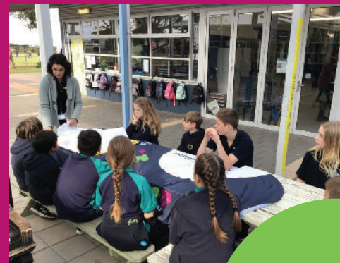
Port Elliot Primary