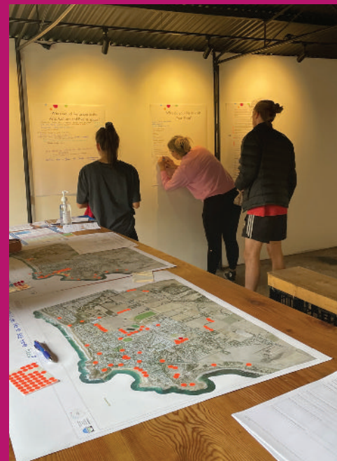
Port Elliot Drop In Session