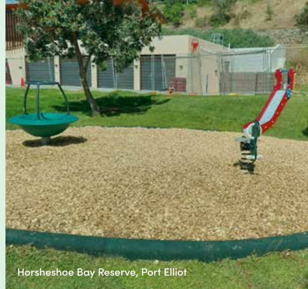
Horsheshoe Bay Reserve, Port Elliot