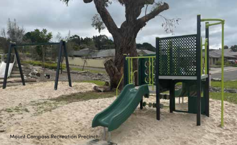
Mount Compass Recreation Precinct