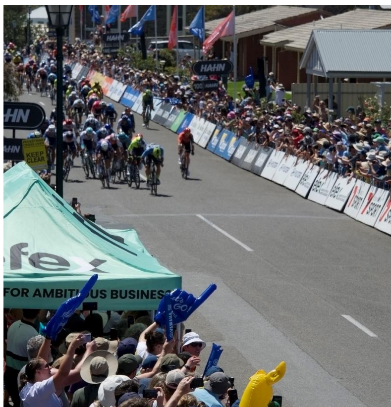
Riders approaching the finish line on The Strand, Port Elliot.

Images provided courtesy of Alexandrina Council. Please contact communications@alexandrina.com.au if you would like high resolution images and captions.