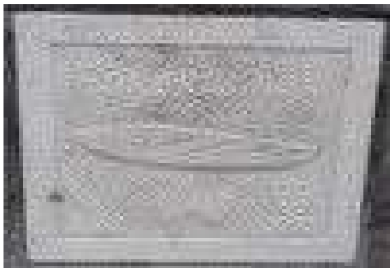
Forerunner plaque at rear of property. It clearly shows a map of Australia on the bottom of the plaque.

The mums were a font of knowledge on the area, and pointed to other plaques relating to Cadell outside the back gate. The toddlers apparently often play on the Forerunner replica.