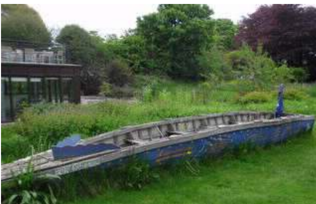
Forerunner 111 (replica)

On entering the main entrance of this heritage building I spoke to the attendant re the history of the area. She admitted she knew nothing of its history or that of Cadell but added "I do know that there's a boat from Australia in the garden!" Well at least we were getting somewhere now!