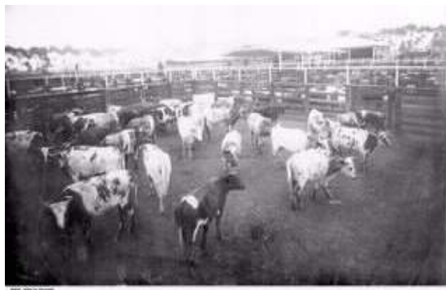
A Typical Cattle Yard

(There was no record of whether the term was further extended after 1954).