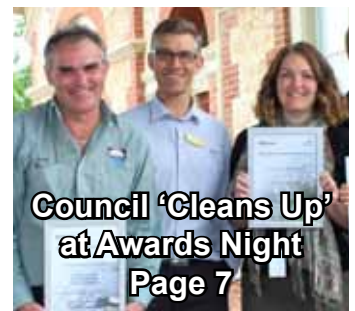
Council 'Cleans Up' at Awards Night Page 7