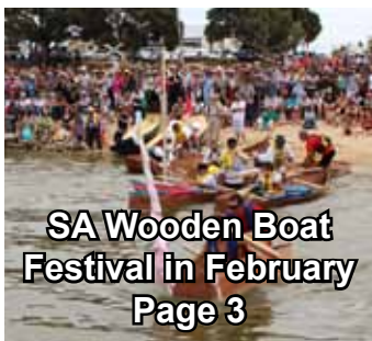
SA Wooden Boat Festival in February Page 3