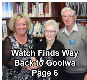
Watch Finds Way Back to Goolwa Page 6