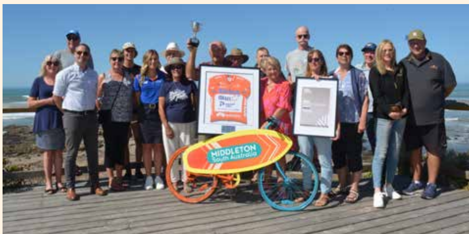
Image: Middleton Town and Foreshore Association members and Santos Tour Down Under officials at the presentation of the Gold Award for the Santos Best Dressed Town in SA.

The MTAFA plans to use its prize money for community art projects to bring joy to the community and its many visitors.