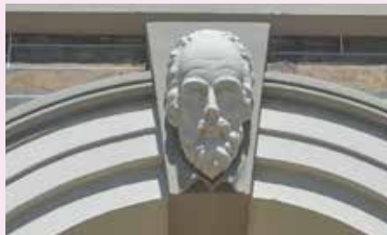
Image: Strathalbyn's Town Hall sculpture

They come into the history room at different hours on different days to collaborate their many different skills ranging from genealogy and digital