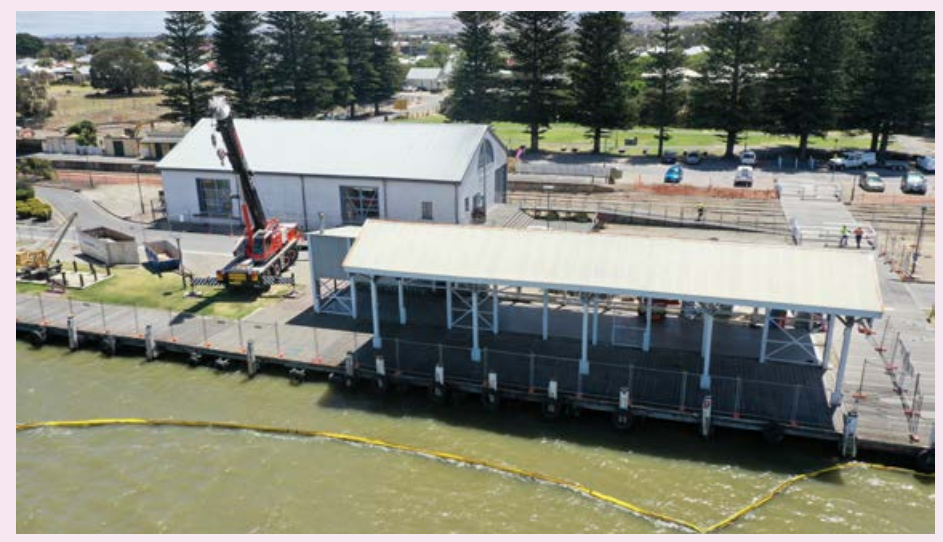
Image: Drone image of the Goolwa Wharf Shed supplied by McMahon Services.

Each building component was given a unique identification tag to assist reassembly of this iconic heritage site.