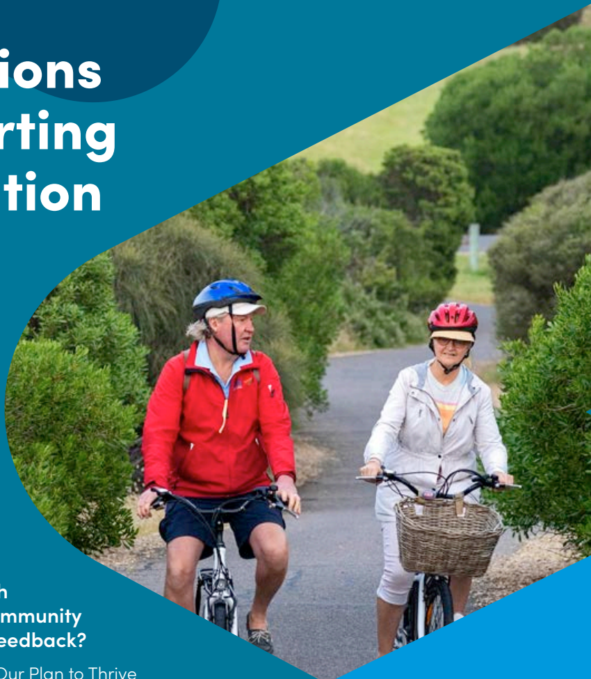
Image: Encounter Bikeway, Ratalang Basham Beach

Register your interest to learn more about Village Conversations at: alexandrina.sa.gov.au/villageconversations